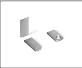
KT206 Kit three short series brackets to weld on.