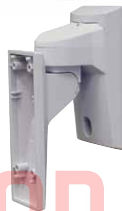
Installation Bracket kit